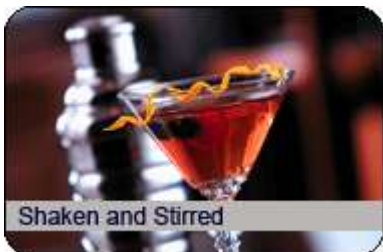
Shaken and Stirred

The evening will conclude with the classic ‘conveyor belt’ round... “A Cuddly Toy”! Ahhhhhh!