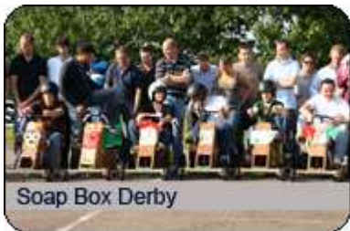
Soap Box Derby

Off Limits will provide the ultimate school sports event incorporating all the games that we loved to hate.