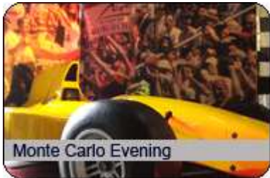
Monte Carlo Evening

The more money they earn the more that is at stake for each team when one guest takes their seat in the 'Who Wants A Million' finale.