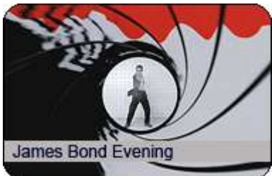
James Bond Evening

After dinner, guests try their luck at the Casino tables, view a cabaret show or even take to the black and white dance floor which feels like a set from a Fred Astaire and Ginger Rogers classic film.