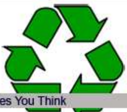
Makes You Think

This is an event that promotes the techniques and skills of traditional carpentry, as teams come together in a fun, yet challenging environment to construct their own 'Eco Shelter'.