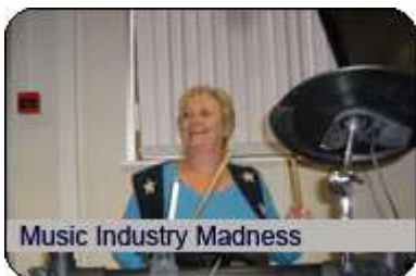
Music Industry Madness

Each team will perform a different scene which will all be linked to create one movie. The teams will have to assign a Director, Head of Props, Starring Role, Camera Man and the Film Extras.