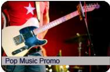
Pop Music Promo

Off Limits will now task the teams with recreating a Music Video, however; the main focus is on the actual production.