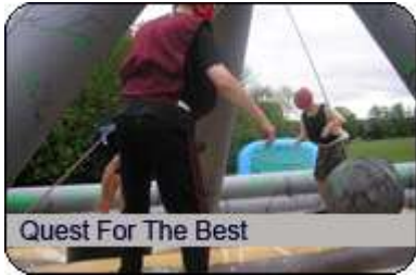
Quest For The Best

A team based event combining the skills of problem solving, time management and delegation. Guests will be given a pack outlining the tasks ahead. The teams must then plan the day ahead to make best use of the time allowed and define responsibilities within their team.