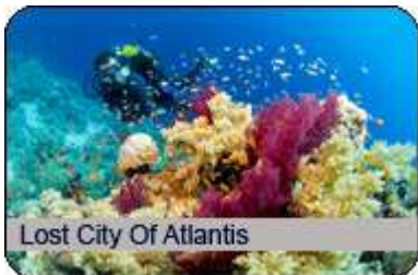
Lost City Of Atlantis

People have been searching for the Lost City of Atlantis for years, plenty never to return to dry land to tell their tale.