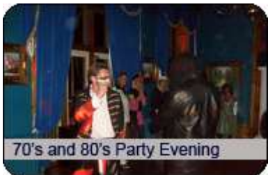
70's and 80's Party Evening

As guests arrive for pre dinner drinks they will be greeted by characters such as Marilyn Monroe, Buddy Holly and Elvis, these will circulate amongst your guests setting the scene for the evening that lies ahead. Whether you're entertained by classic Swing or Rock and Roll Hand Jives we'll theme and evening that will thrill and enthrall.