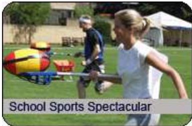
School Sports Spectacular

The pack will contain the list of the overall objectives for the day. In addition; it will have a planned itinerary of time slots that have been allocated to take part in various activities. Late arrival or failure to arrive within their allocated slot will result in points being deducted from them.