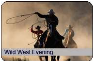
Wild West Evening

With Top Hats and petticoats, Bustles and canes this evening will be sure to give you a taste of the Victorian era that no other can with a host of props, themed lighting and entertainment.