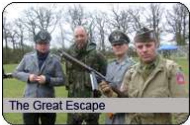
The Great Escape

Each crystal buys seconds in the finale activity, the Crystal Dome, where you must collect as many golden tickets as you can – avoiding the silver ones – in order to see which team finally becomes the champions of the Maze.