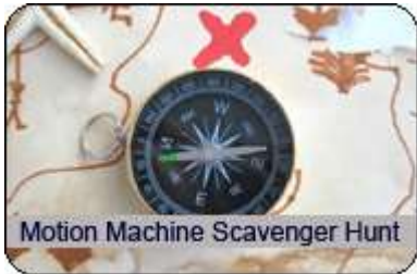
Motion Machine Scavenger Hunt

The group will then be divided into teams who will be given the final objective of rescuing the kidnap victim. Armed with a compass, map and your own sense of direction teams will have to navigate their way through the event and complete the challenges set for the team.