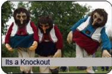
Its a Knockout

There's It's a Knockout and there's The It's A Knockout – Off Limits own and operate the original props and games that were part of the genuine BBC Television programme.