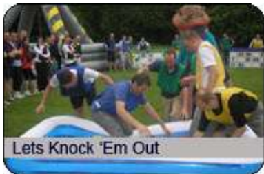
Lets Knock 'Em Out

Which team will collect the most stars and be crowned Kings and Queens of the Jungle?!