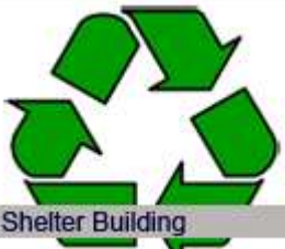
Eco Shelter Building