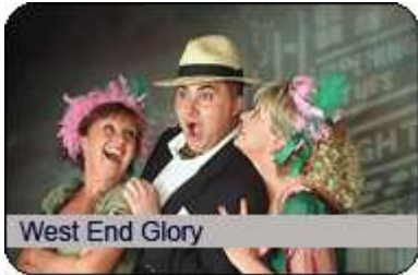
West End Glory

With the opportunity to ask the expert as well as several interspersed rounds such as Chic or Cheap, this is a fantastic event that works well over an afternoon or evening.