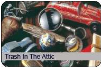
Trash In The Attic

Trash In The Attic is a great event, where we encourage the budding curators, archaeologists and antique experts to step forward and test their knowledge.