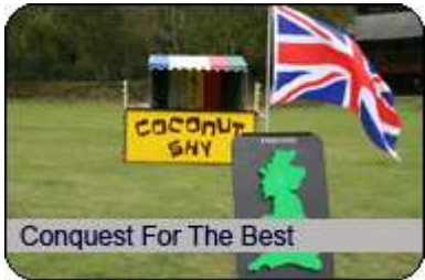
Conquest For The Best

Off Limits offers you the opportunity to take part in this highly strategic, highly competitive and highly amusing event for total world domination.