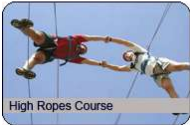
High Ropes Course

Your guests will be in teams, split between Gladiators and Contenders, competing against each other in a series of highly amusing, fun and active challenges throughout the afternoon gaining points along the way before facing the final Eliminator course, the ultimate finale challenge.