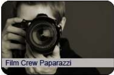
Film Crew Paparazzi

Why not try an exciting 'Hollywood' style welcome for your guests with our Fifties style 'HOLLYWOOD PAPARAZZI'!