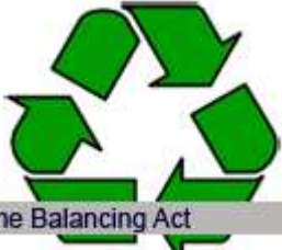
A Fine Balancing Act

Climate change and global warming bring to the fore the many facets of our changing world.