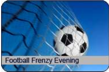
Football Frenzy Evening

An evening of sweet sensations, wonderful creations and altogether delightful entertainment.