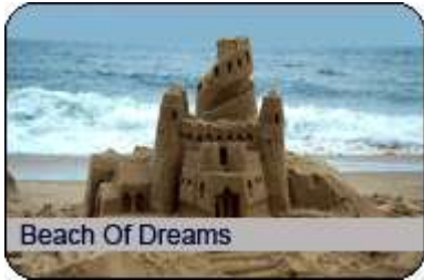
Beach Of Dreams

What better way to build teams than Sand Castle Building! Your group will be divided into 20 teams and allocate an area for each group and quite simply ask them to build there very own sand castle!!