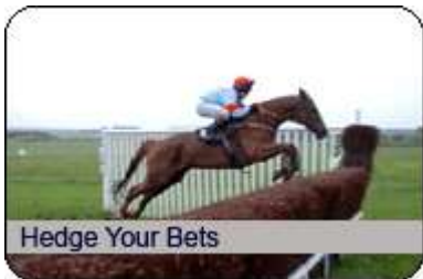
Hedge Your Bets

In addition there are also grandstands, spectators, pit buildings, mechanics, additional cars, trees and shrubs to complete the race meeting atmosphere.