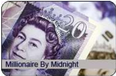
Millionaire By Midnight

An exciting evening where guests have to invest their initial 'Kitty' of £10,000 to make as much money as possible to become the overall winning team.