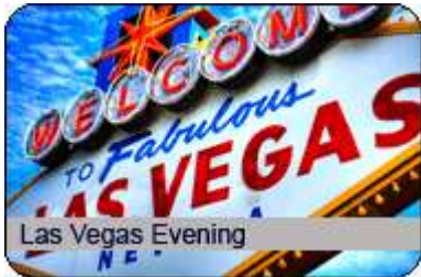
Las Vegas Evening

With distant drums ebbing through the air, thick swamp vines trailing the sky and a bubbling Jungle Juice potently popping away this will prove to be a exotic evening to remember.