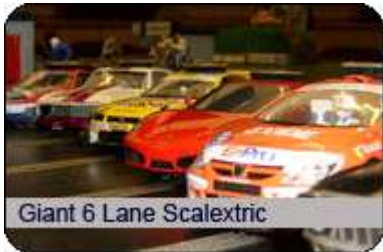
Giant 6 Lane Scalextric

Dressed in mackintoshes, trilby hats and complete with period type flashing cameras, our 'paparazzi' will greet your guests as they arrive, giving them a true Hollywood style welcome.