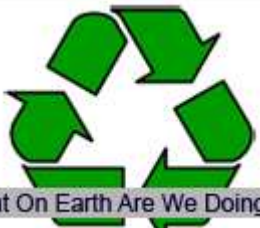
What On Earth Are We Doing?

Creativity, the best use of resources and actively working towards a common goal, will ensure your teams are motivated into action - leading the way for your business to make real green changes!