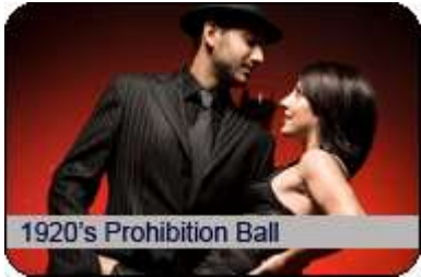
1920's Prohibition Ball

It's 1929 in prohibition Chicago, a city where crime is out of control and Al Capone is the law! Guests arrive to join a huge illegal party being held to celebrate Capone's recent victory over Bugsy Malone.