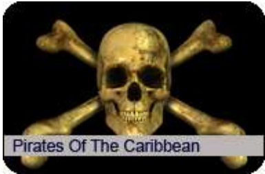
Pirates Of The Caribbean

Your guests are invited to dine with Captain Jack and his motley crew in an evening of cut-throat entertainment that will be sure to bring out the Pirate in everyone.